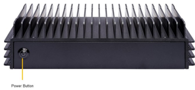
(Rear View – System)