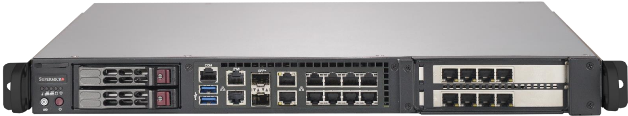
1019D-16C-FHN13TP Edge Server

The Supermicro 1019D-16C-FHN13TP is a short-depth 1U rackmount server optimized for edge computing applications. It supports an Intel® Xeon® D D-2183IT 16-core processor and two PCI-E expansion cards, such as network accelerators and AI inferencing cards.