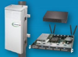
5G / Edge / IoT

Global Onsite Services and Open Industry Standard Management Software for Maximum Scale, Efficiency, and Reliability