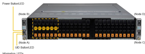
(Front View – System)