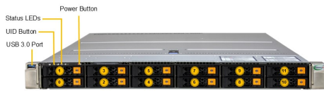
(Front View – System)