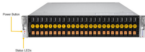
(Front View – System)