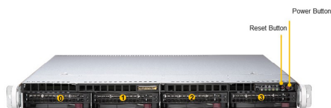
(Front View – System)