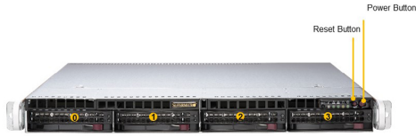
(Front View – System)