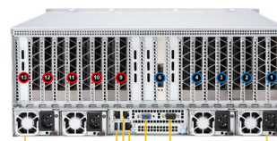
(Rear View – System)