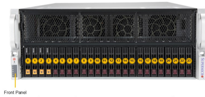
(Front View – System)