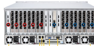
(Rear View – System)