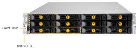
(Front View – System)