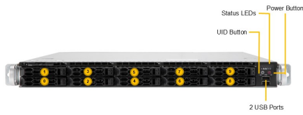
(Front View – System)