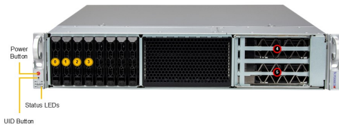
(Front View – System)