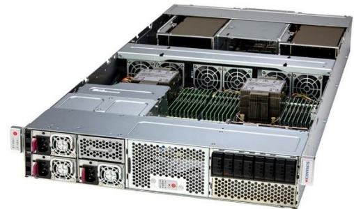
Fig. 3 GPU SuperServer SYS-221GE-NR