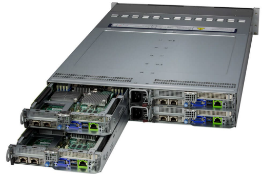
Fig. 3 1. BigTwin SuperServer SYS-221BT-HNC9R