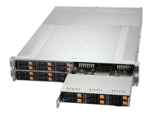
Fig. 3 GrandTwin SuperServer SYS-211GT-HNC8R