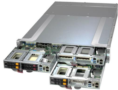
Fig. 3 GrandTwin SuperServer SYS-211GT-HNC8F