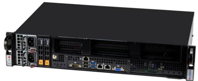
Fig. 3 1. IoT SuperServer SYS-211E-FRN2T