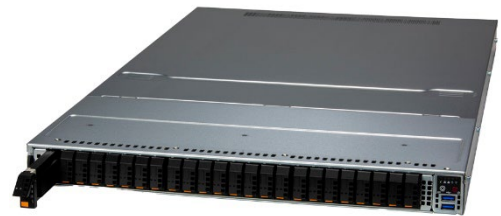
Fig. 3 1. Storage SuperServer SSG-121E-NES24R