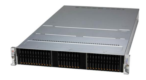
Fig. 3 Storage A+ Server ASG-2115S-NE332R