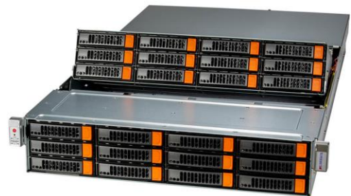
Fig. 3 Storage A+ Server ASG-2015S-E1CR24H