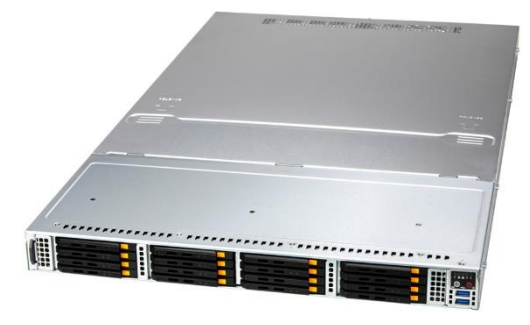
Fig. 3 Storage A+ Server ASG-1115S-NE316R

Table 1: Weight and recyclability rate for storage A+ Server ASG-1115S-NE316R