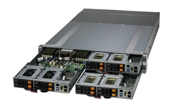
Fig. 3 GrandTwin A+ Server AS -2115GT-HNTF