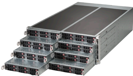
Figure 1. Supermicro® FatTwin™ SuperServer®

Supercomputing costs can be prohibitive. Supercomputers can cost upwards of several hundred million dollars in capital expenditures (CAPEX), and many millions more in yearly maintenance, energy, and cooling operating expenditures (OPEX). So when Rutgers set out to acquire a supercomputer to support the computing needs of its world-class faculty, it utilized the most stringent criteria and a highly competitive bidding process to select the best infrastructure vendor that provides dramatic increase in computation power over current systems, greater speeds and expanded storage capacity to faculty, researchers and students across Rutgers and the state.