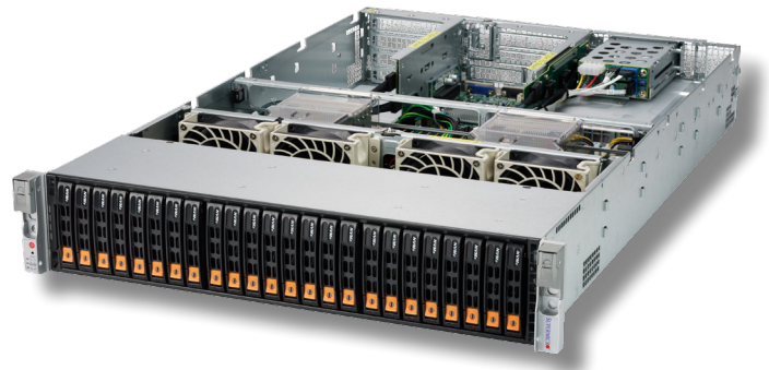
Figure 1. Supermicro 2U Ultra SuperServer 2028U-TN24R4T+. Featuring 24 hot-swap NVMe/SAS3 hybrid drive bays.

In addition, the 2U Ultra is also known for its storage and I/O expansion capabilities. The latest SYS-2028U-TN24R4T+ model supports up to 24 hot-swap NVMe SSDs, plus additional 2 hot-swap SATA3 drive bays located on the back of chassis for log files or operating system (2 SATA DOM ports are also present on the motherboard).