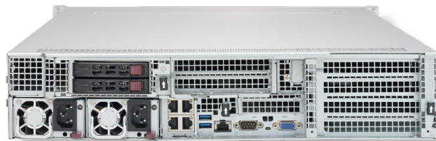
Figure 2. Back of SYS-2028U-TN24R4T+. Featuring 2 hot-swap SATA3 drive bays, redundant Titanium-level power supplies, 2 PCI-E 3.0 x16 slots and 1 PCI-E 3.0 x8 LP slot, 4x 10GBase-T ports, 2 USB 3.0 ports, a dedicated IPMI LAN port, a serial port and a VGA port.