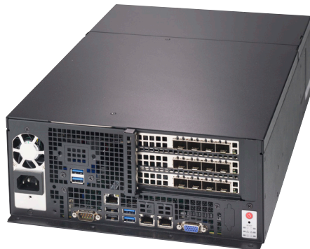
Figure 3. E403-9P-FN2T for deployment in more demanding environments