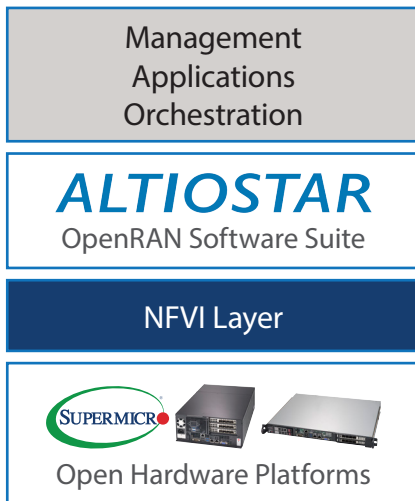
Figure 1. AltioStar/Supermicro O-RAN Solution

Supermicro and AltioStar together can provide a complete open architecture reference model based on O-RAN, using best-in-class hardware and software.