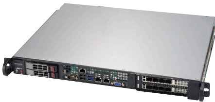
Figure 2. 1019P-FHN2T for controlled environments

Supermicro's new 1019P-FHN2T and E403-9P-FN2T servers bring 2nd Gen Intel® Xeon® Scalable processors to the 5G NR RAN. They include the ability to support 2 or 3 PCI-E expansion cards for FH and MH interfaces.