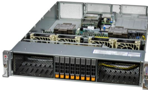
Figure 1 – Supermicro Hyper System

Supermicro Demonstrates Performance Gains for High Performance Computing Benchmarks When Using 5th Gen Intel Xeon Processors and Liquid Cooling