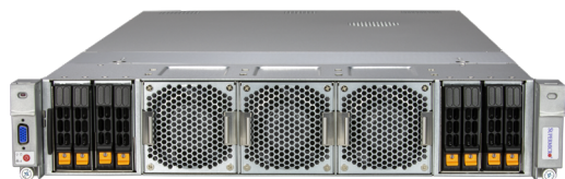
2U AS -2145GH-TNMR (Liquid-cooled)

Powered by AMD Instinct™ MI300A Accelerators