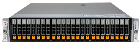
2U A+ Server 2125HS-TNR (NVMe/SAS/SATA)