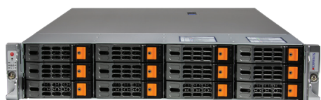
2U A+ Server 2025HS-TNR (NVMe/SAS/SATA)