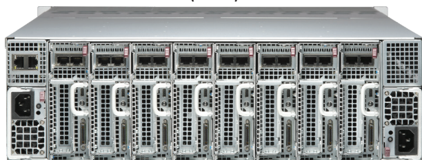
A+ Server 3015MR-H8TNR (rear)