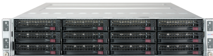
A+ Server 2014TP-HTR “TwinPro®”