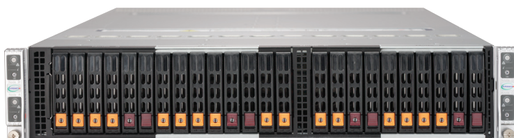
A+ Server 2124BT-HNTR “Big Twin®”

High Density Combined with Low Cost through Resource Sharing