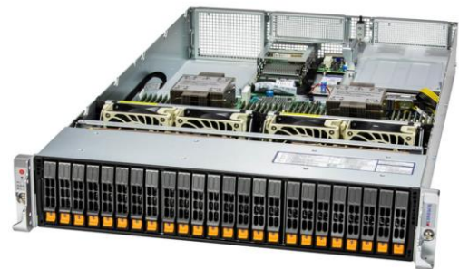
Fig. 3 Hyper SuperServer SYS-221H-TN24R