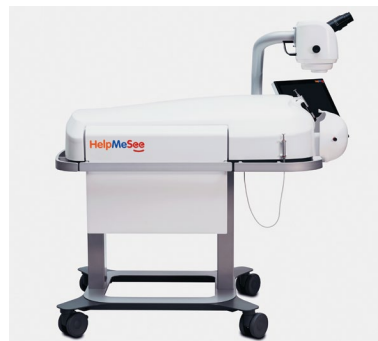
The Eye Surgery Simulator is shipped to training facilities worldwide

HelpMeSee is eliminating cataract blindness by training ophthalmologists in MSICS. The HelpMeSee Eye Surgery Simulator, constructed with servers and graphics components, is located in their training sites worldwide. The Eye Surgery Simulator accurately models the human eye and all of the required surgical instruments used in MSICS. Students can become familiar with the MSICS procedure and possible complications well before operating on a patient. Traditional training takes several months to a year, based on previous skill levels and the number of training opportunities available. The HelpMeSee training program with the Eye Surgery Simulator involves only six days of training. Through their simulator and its unlimited supply of virtual eyes, a student can achieve a greater level of proficiency and a safer patient experience.